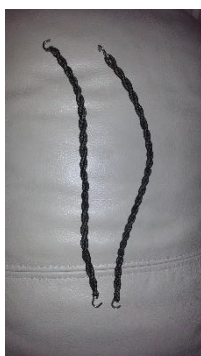
This is a Boot Blouser

Blousing without Boot Blousers: You will find two strings at the bottom of your pant leg and these are used to blouse boots without the boot blouse. All you have to do is tie the two strings tightly together acting like an elastic band around your leg. Also if you do not have these strings or Boot Blousers then you can use Elastic Bands or Hair Ties as a substitute.