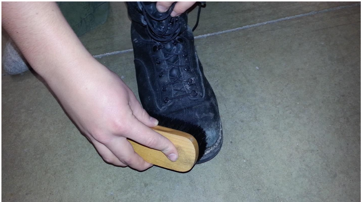
The polish is being applied to the boot. This is called Blackening.

The holes that your laces go through will wear out but the way to fix this issue is to take a black sharpie marker and color the metal. The trench around the boot is a death trap for mud. The way to clean and blacken this part is to take an old tooth brush and apply polish to the brush and rub the polish all through the trench of the boot till it's nice and black.